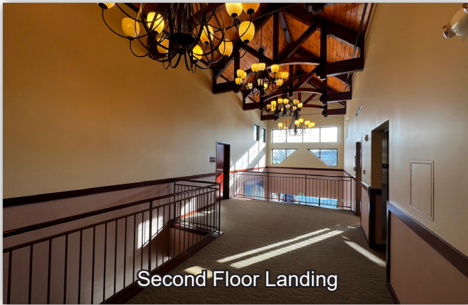
Second Floor Landing