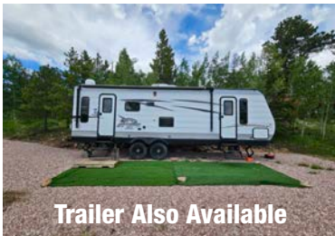
Trailer Also Available